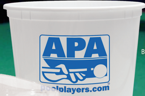
5 Qt. Bucket