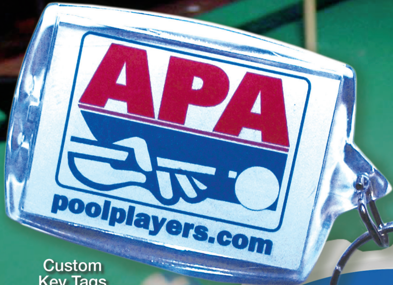
Custom Key Tags