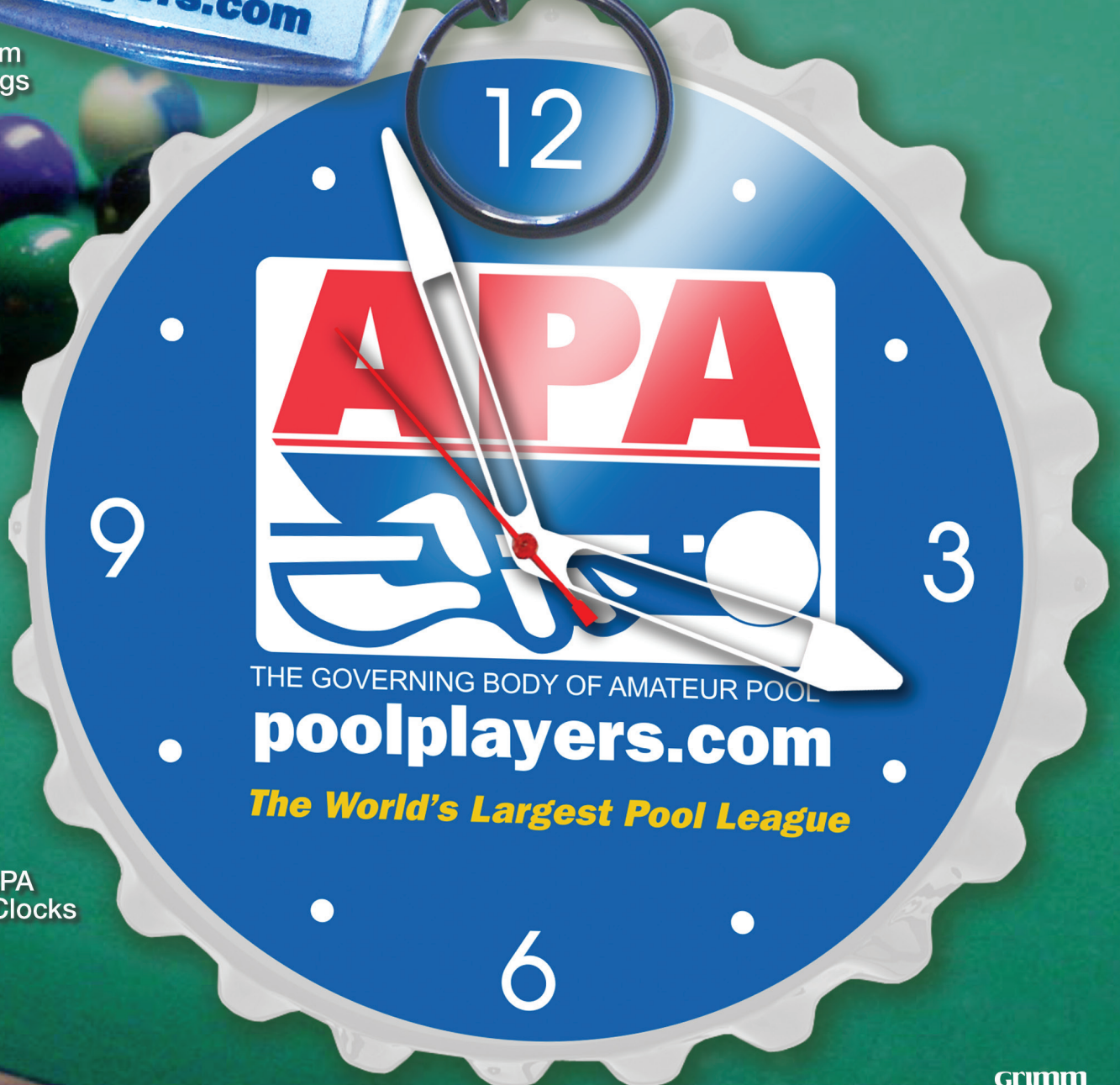
APA & CPA Bottle cap Clocks

7070 WEST RIDGE ROAD • FAIRVIEW, PA 16415 814-474-2648 • 800-331-6438 • FAX: 814-474-2210 E-MAIL: phil@grimindustries.com