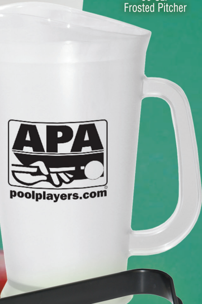
60 Oz. Frosted Pitcher