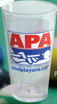
16 Oz. PubLite Glass