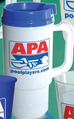
14 Oz. Travel Mug