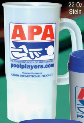
22 Oz. Stein