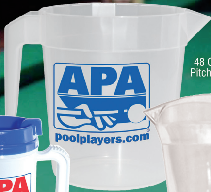
48 Oz. Pitcher