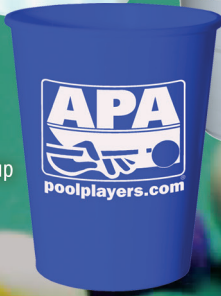
17 Oz. Stadium Cup