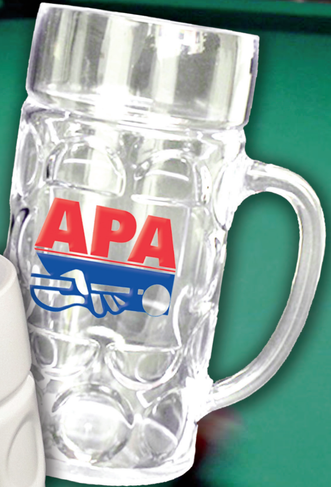
DIMPLED STEINS 1L & 1.5 L in Clear, White,

7070 WEST RIDGE ROAD • FAIRVIEW, PA 16415 814-474-2648 • 800-331-6438 • FAX: 814-474-2210 E-MAIL: phil@grimmindustries.com