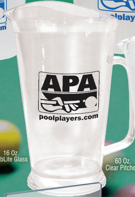
60 Oz. Clear Pitcher